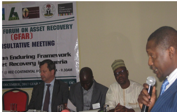
Abubakar Malami, SAN, making a statement

Malabu deal. Other groundbreaking remarks and commitments from the Nigerian Government which the announcement above seemed to overshadow are contained in the