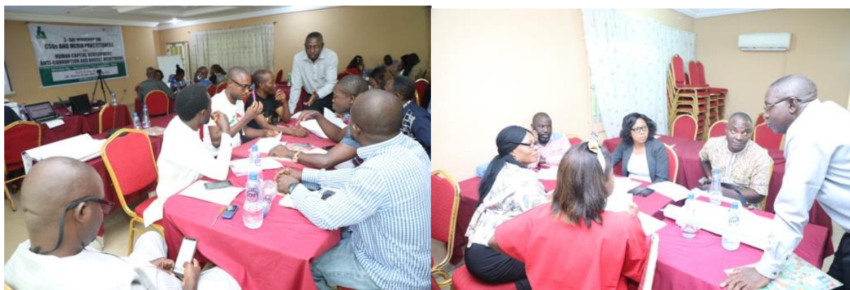
Participants brainstorming session