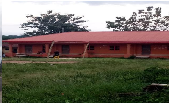
Ambrose Alli University, Ekpoma (AAU) Administrative Block