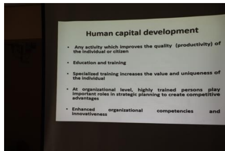
Presentation slide on Human Capital Development